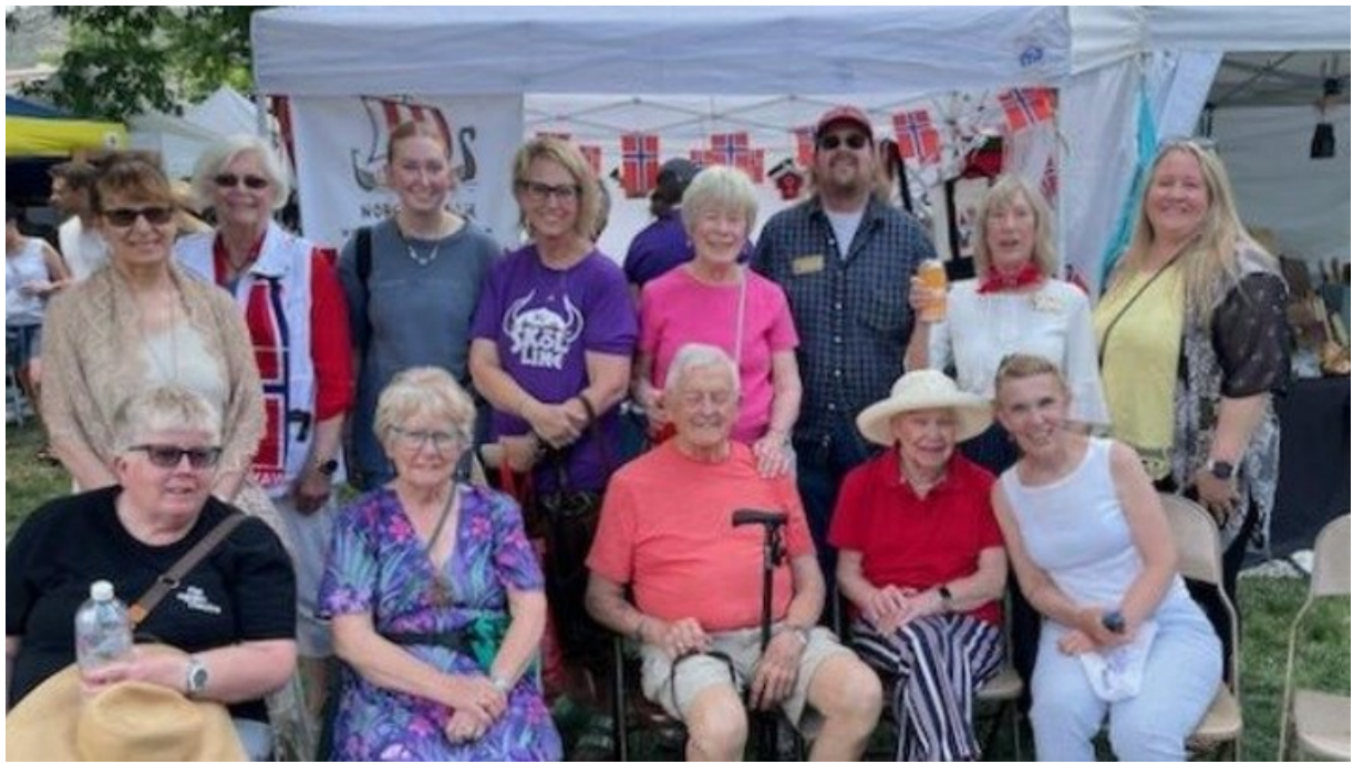
Scandinavian Festival 2024

Sons of Norway Trollheim Lodge 6-110 6610 W 14th Ave Lakewood, CO 80214