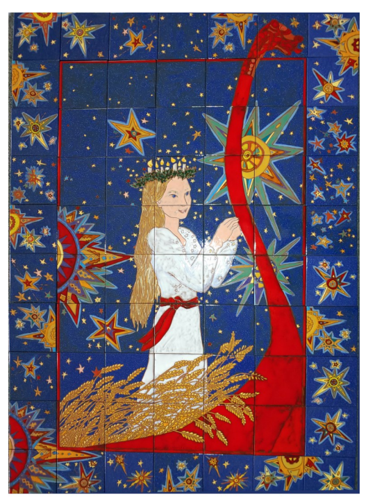
LUCIA 70 tiles 42 inches wide 60 inches high

California artist Elaine Cain had 7 large ceramic tile displays that she wanted to donate a few years ago. Each tile set has a Norwegian theme. No lodge in CA had the capacity for them. Then via Pat LaMoe, Trollheim Lodge became the recipient of the 6' x 8' tile artwork. Almost immediately, some members purchased a set at $500 each. Trollheim Lodge board members want to retain two of them for display at Trollheim. That leaves one available for purchase, Santa Lucia, a young lady wearing lighted candles on her head, bringing light into the winter darkness in Norway and Sweden. If you are interested in purchasing it, contact Treasurer Connie Bartram. First come, first served.