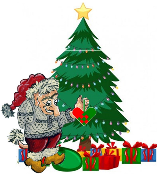
Loki decorated this tree

The Monkeliens' 3 generations plus doggie decorated the Trollheim tree