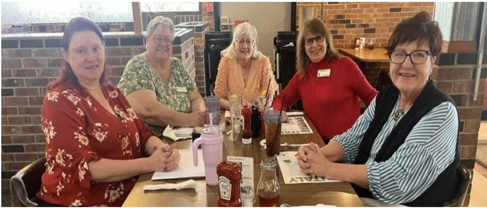
Dameklubb ladies enjoying lunch at the Wishbone Restaurant